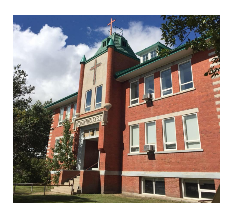
Welcome to St. Martin's Catholic School

Our staff would like to welcome all of our students back to school as well as welcome all new students to our school and community. St. Martin's School is committed to ensuring all students are successful. We have a dedicated and very hardworking group of teachers and support staff. We believe in supporting all students to achieve as much as they can each year - we set high expectations for learning! Each teacher expects that their students will be highly dedicated to their academics. Welcome to another school year full of engaging and exciting learning opportunities for all students!!